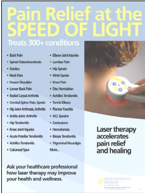
18 x 24 Poster

Now that you have laser therapy equipment, how do you promote it to your patients? We can help. Contact us and request free advertising templates or order low-cost brochures, posters and other materials. Our goal is for you to succeed.