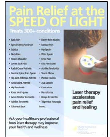
Point of Purchase Display